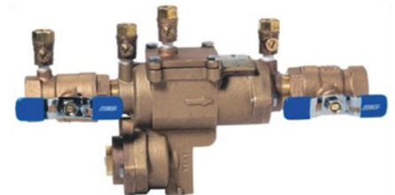
Reduced Pressure Double Check Valve