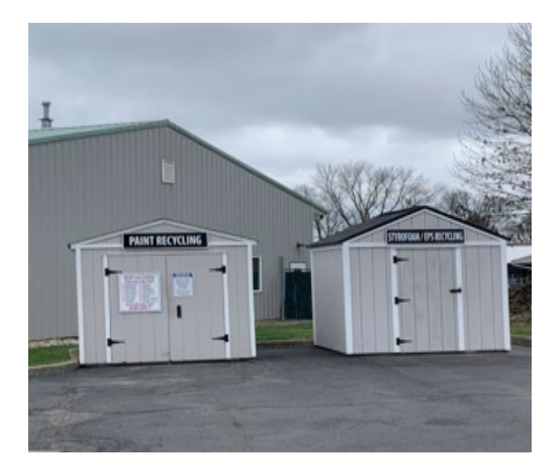
MEET AT RECYCLE SHEDS

If you need to reschedule, please call Supervisor number in advance so we can schedule someone else on the waiting list.