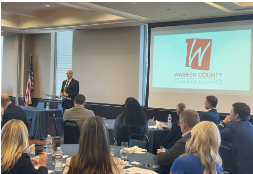
Congressman Greg Landsman addressing attendees of 10th Annual Chamber Alliance DC Fly-In

The Warren County Chamber Alliance hosted its 10th Annual DC Fly-In this September! Since it was created, the Chamber Alliance has had a three-pronged mission to better educate, communicate and advocate on behalf of Warren County. With 85 attendees from education, nonprofit organizations, public and private leaders, the Fly-In has grown over the years and continues to be a successful community and regional event. While in DC the group met with Congressman Greg Landsman on several occasions, heard from Senator Sherrod Brown, Congressman Warren Davidson, and Fox News Correspondent, Jennifer Griffin, to name a few. Additionally, attendees were divided into smaller groups for federal agency breakout meetings to hone in on matters impacting their organizations and priorities that effect all of Warren County.